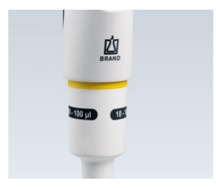
Integrated shaft coupling