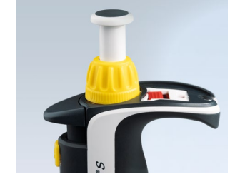
Easy Calibration technology